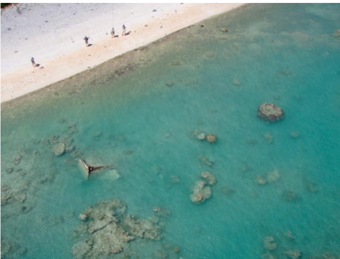
The KAP team on the west shore of Nikumaroro surveying wreckage of the ship Norwich City.