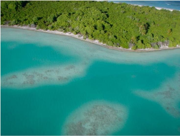
A view from above the lagoon showing coral heads, the cloudy water of the lagoon, the narrow strip of land comprising the atoll and the Pacific Ocean in the top of the frame.