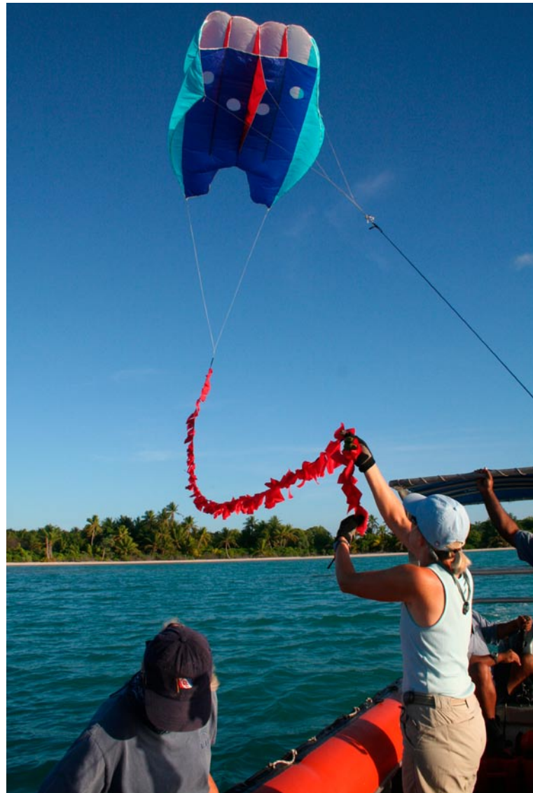
The Flowform 16 flies over the lagoon